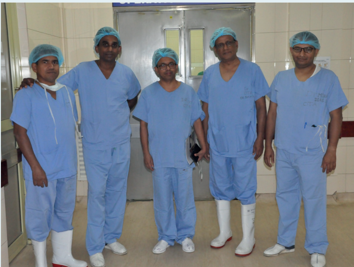
The President and the Secretary of the Central Chapter with the resource panel