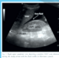
Fig. 1. Right upper quadrant view displaying a normal liver and kidneys during the study period with this fluid results in Marfan's point.

Tel: 0112682290, email: collsurg@gmail.com